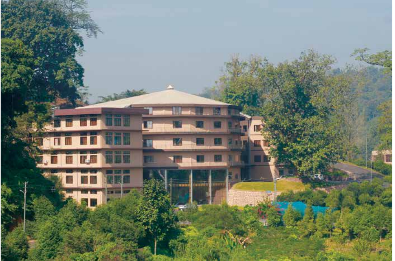
Academic Block V , Tapesia Campus